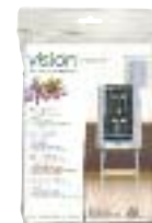
VISION® S02 Night Cover ART. 83222 For Vision® model S02