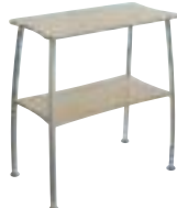
VISION® STAND Large ART. 83320 For VISION® models L01/L02/L11/L12