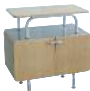
VISION® CABINET STAND Large ART. 83222 For VISION® models L01/L02/L11/L12