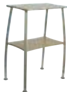
VISION® STAND Medium ART. 83270 For VISION® models M01/M02/M11/M12