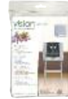
VISION® M01/M11 Night Cover ART. 83280 For Vision® models M01/M11