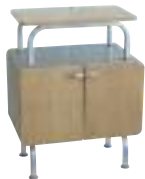
VISION® CABINET STAND Medium ART. 83272 For VISION® models M01/M02/M11/M12