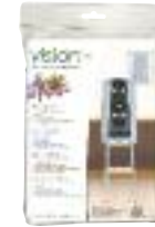
VISION® M02/M12 Night Cover ART. 83282 For Vision® models M02/M12