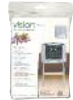
VISION® L01/L11 Night Cover ART. 83330 For Vision® models L01/L11