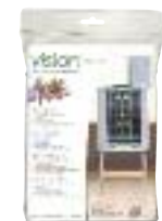
VISION® L02/L12 Night Cover ART. 83332 For Vision® models L02/L12