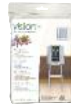
VISION® S01 Night Cover ART. 83220 For Vision® model S01